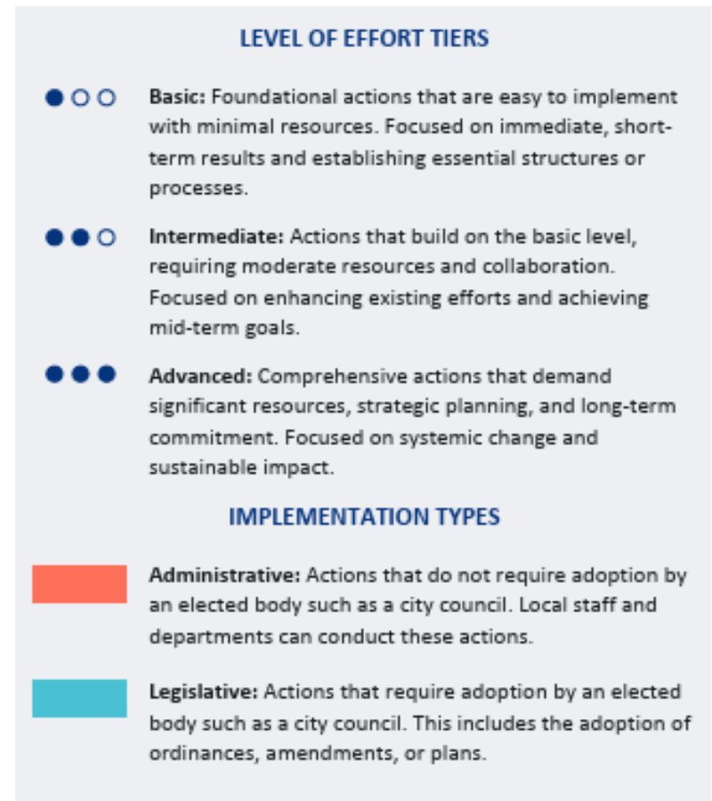
Figure 1: Classification Icons for Local Actions